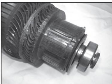
Lifting Commutator Bars (high amp stall)

The photos below are examples of armatures damaged beyond repair due to excessive R.P.M. or stalling. Motors being returned under warranty with problems stated herein are NOT covered by the manufacturers warranty.