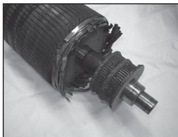
Exploded Commutator (excessive R.P.M.)